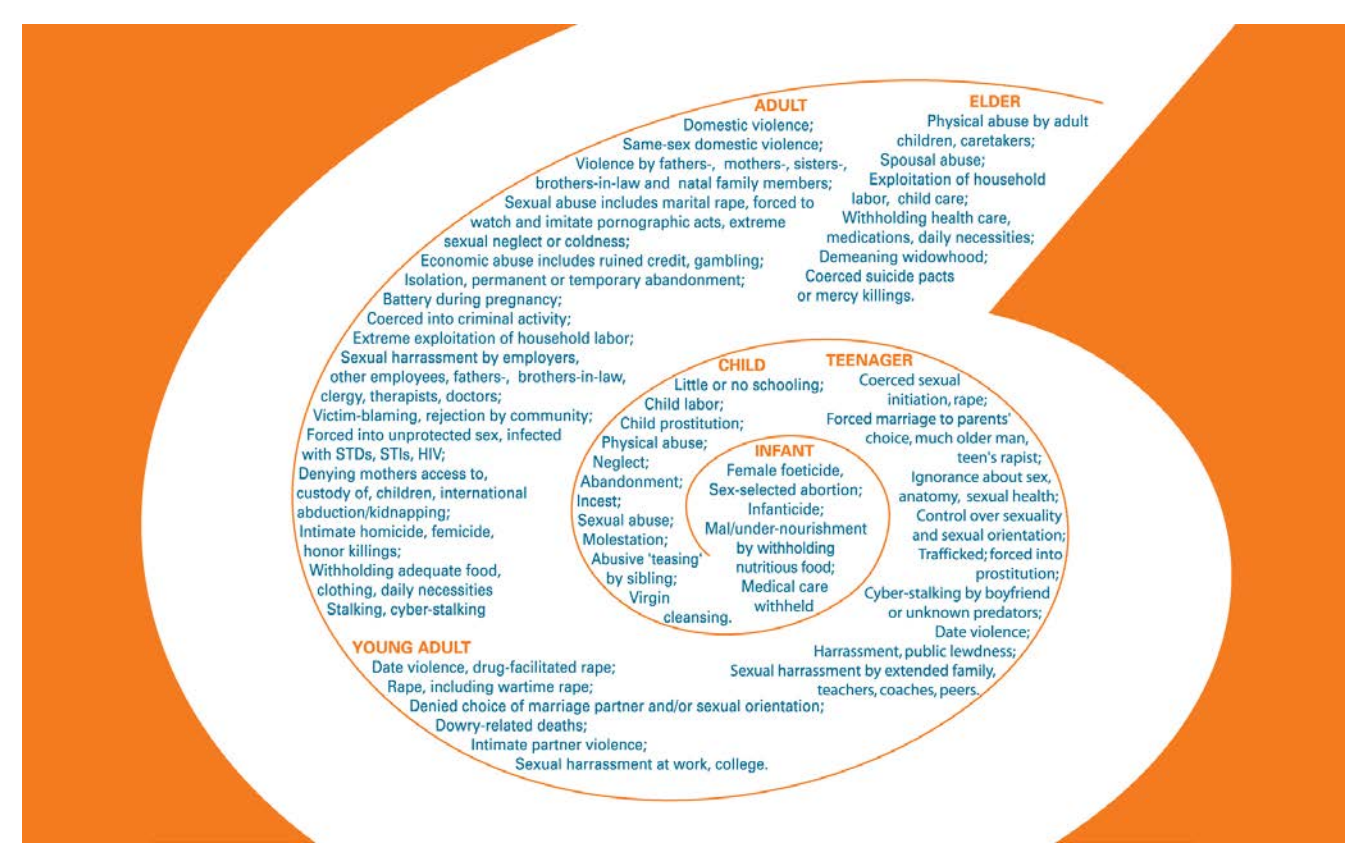
Figure 1: Lifetime Spiral of Gender Violence